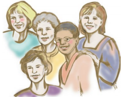
Women of the Church

Vesper Guild only meets once a month and it is usually the fourth Tuesday of the month unless certain circumstances require us to gather sooner. Our next meeting however is Tuesday, April 30. The Annual Mother/Daughter banquet will be on Sunday, May 6th at 6:00 PM in the Hart Center.